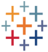
Tableau is business intelligence software to help you see and understand your data. Charity discount available

Power BI is a Microsoft business analytics service - use to create interactive visual reports and dashboards. Access via Office 365 or download the desktop app for free.